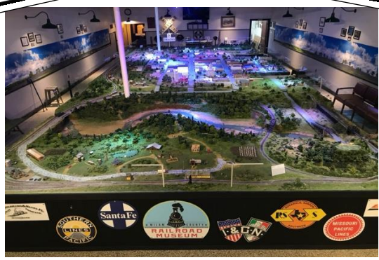
MILAM COUNTY RAILROAD MUSEUM 110 W. 1 st St. Cameron, TX 76520

Hearne: 806-790-4659 Rockdale: 512-446-2020 Cameron: 254-697-7055