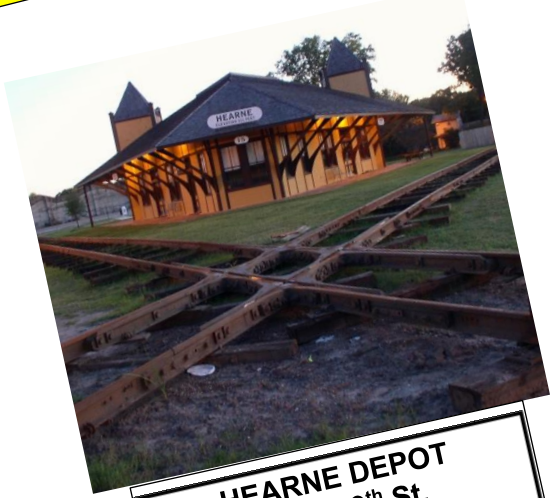
HEARNE DEPOT 130 W. 9 th St. Hearne, TX 77859